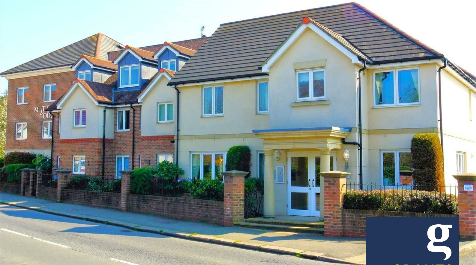
Matthews Lodge, Station Road, Addlestone, KT15 2FB